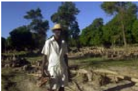
Jeanne Haiti: A Haitian farmer walks through a destroyed banana plantation outside Gonaives, Haiti, Wednesday, Sept. 29, 2004. Hurricane Jeanne wiped out vast areas in Haiti's farming communities threatening to leave the country without food.