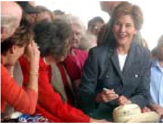
Laura Bush: First lady Laura Bush has her picture taken as she visits with the crowd during a rally Wednesday, Sept. 29, 2004, at the Curry County Fairgrounds in Clovis, N.M. The first lady urged a mostly Republican crowd in this eastern New Mexico city to reach out to Democratic and independent voters to help win the state and re-elect her husband to a second term.