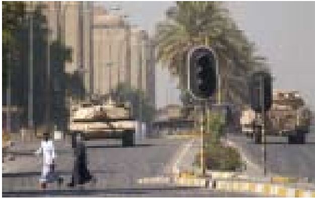
Iraq: U.S. soldiers block off access during a raid at Haifa street in Baghdad, Iraq, Wednesday Sept. 29, 2004. Iraqi security forces backed by U.S. troops arrested six suspected terrorists operating on Baghdad's Haifa Street on Wednesday.