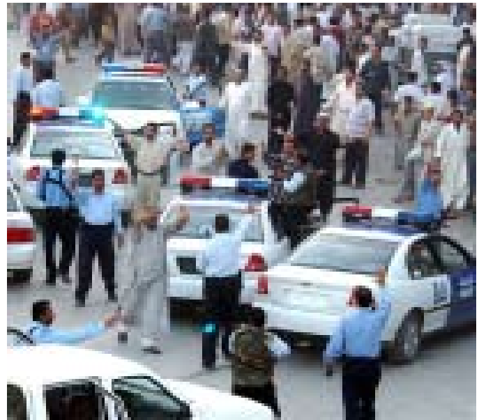
Iraq 2: Police officers try to calm the public after firing in the air to disperse a demonstration by followers of radical Shiite cleric Muqtada al-Sadr, in the holy Shiite city of Karbala, Iraq, Wednesday Sept. 29, 2004. Hundreds of thousands of Shiites are expected to visit Karbala's holy shrines of al-Hussein and al-Abbas, sons of Imam Ali, one of the most revered Shiite holy men.