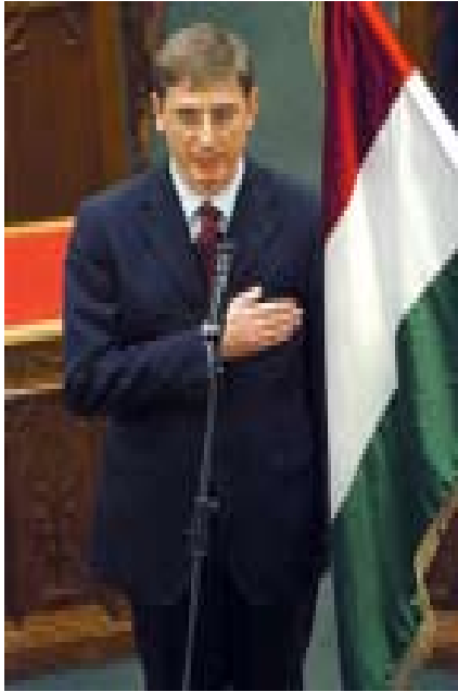
Hungary: Ferenc Gyurcsany, Hungary's new prime minister, is taking the official oath of office as the Hungarian Parliament elected him prime minister on Wednesday, Sept. 29, 2004 in Budapest, Hungary.